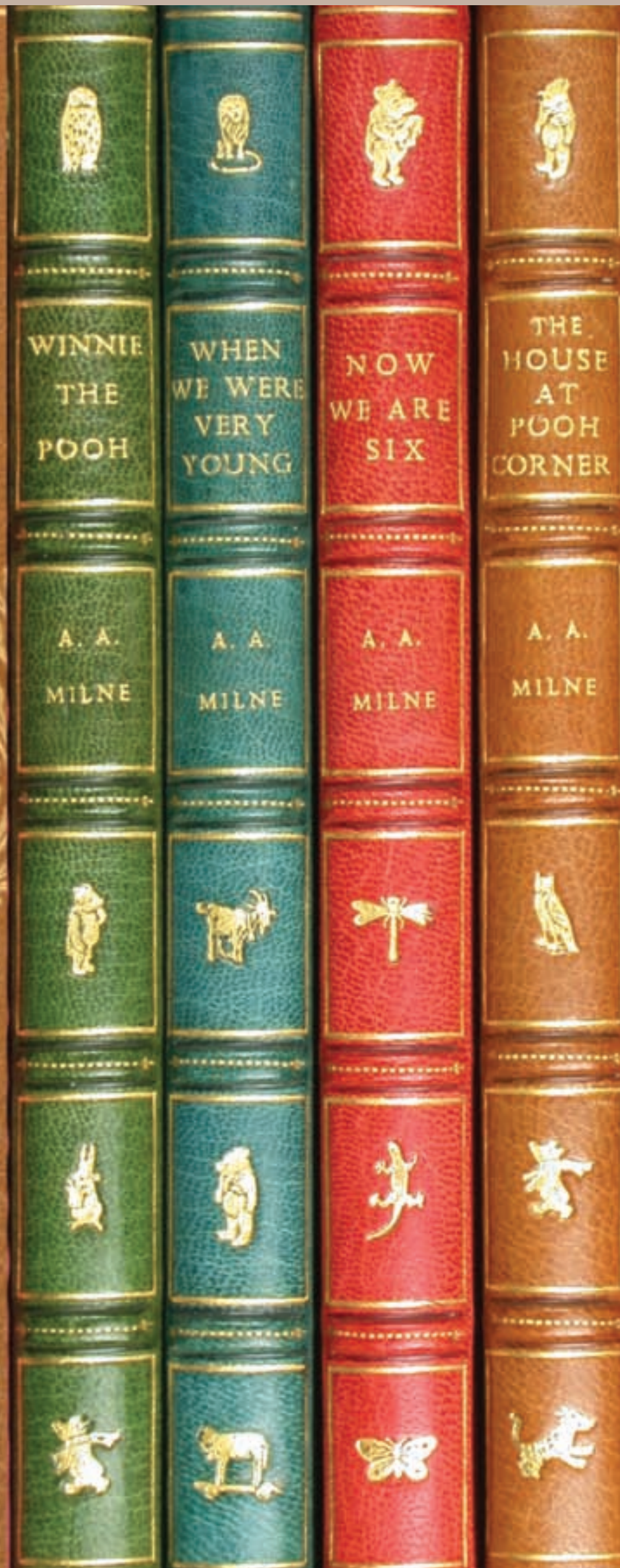
First edition boxed set of Winnie the Pooh

University Libraries has Kindles and iPads for loan to students.