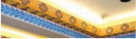
Page 3: Dean Gift Supports Institute