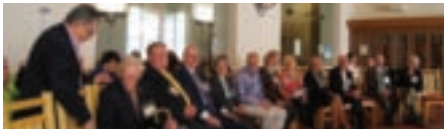
Page 4: Dean's Circle Event