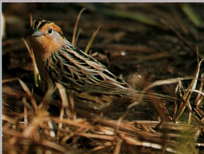
Most unexpected in the mountains of Colorado was this Le Conte's Sparrow at Estes Park in late April 1998.

Another view of the Black Noddy at Bolivar Flats on May 1, 1998.