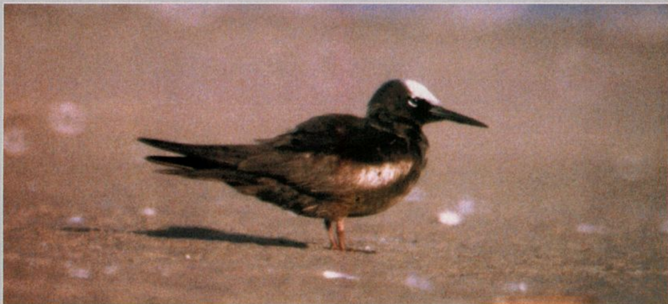
Several teams participating in the Great Texas Birding Classic encountered this tern at Bolivar Flats on May 1, 1998. It was clearly a noddy, a very rare find in Texas, but opinion was divided at first as to which species it was. This portrait shows the very narrow, long bill typical of Black Noddy.