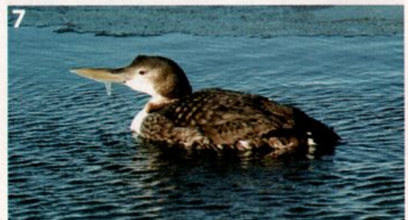
7 • Furnishing the seventh record for Montana, this Yellow-billed Loon was found 4 (here 5) January 2007 on the Missouri River in Great Falls and remained for several days.