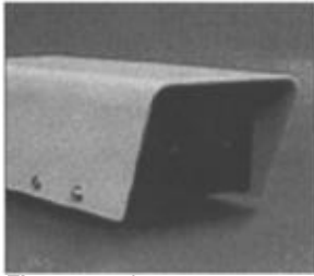
The auto-color camera includes IR and color cameras with an automatic light-sensitive switching device.